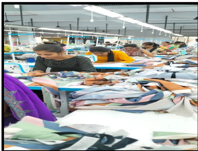
On Job Training