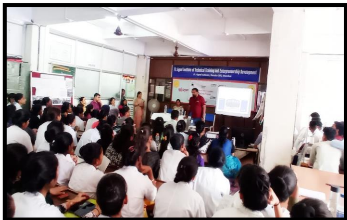
Workshop : Fire and Safety