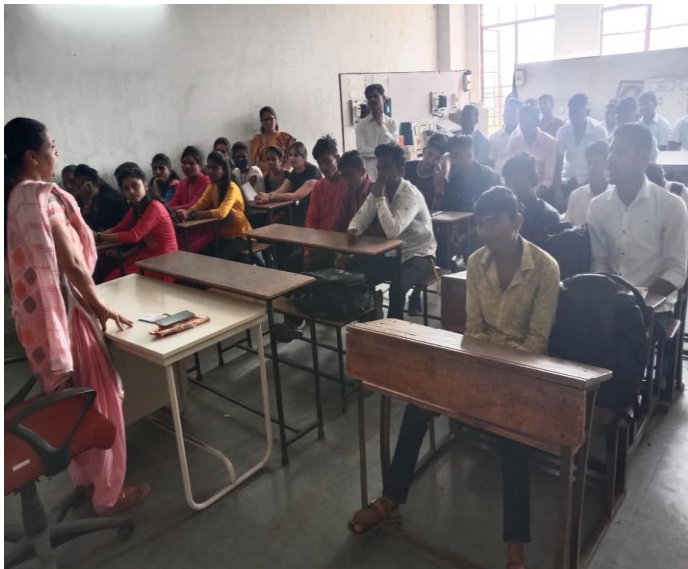
Bank Person Lecture