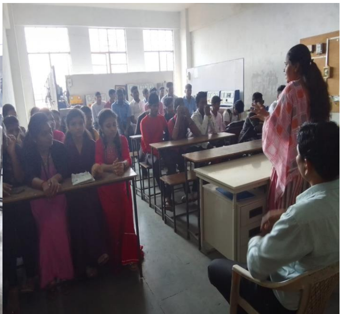
Bank person Lecture