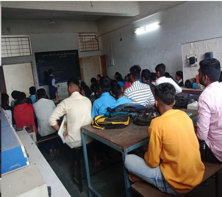
English Speaking Lecture