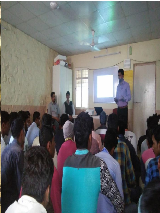
Workshop Resume Writing