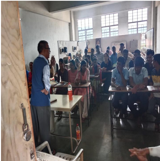
English Speaking Lecture