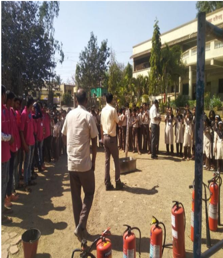
Workshop: Fire and Safety