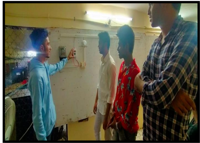
Student Centered Activity: PPT Presentation