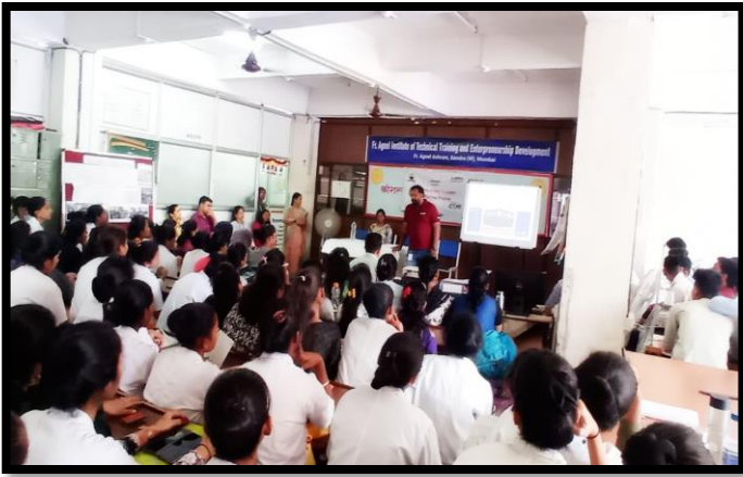
Workshop : Fire and Safety