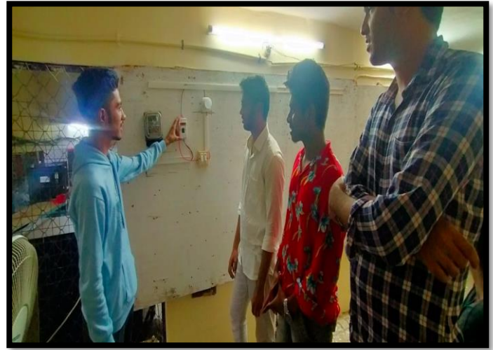
Student Centered Activity: PPT Presentation