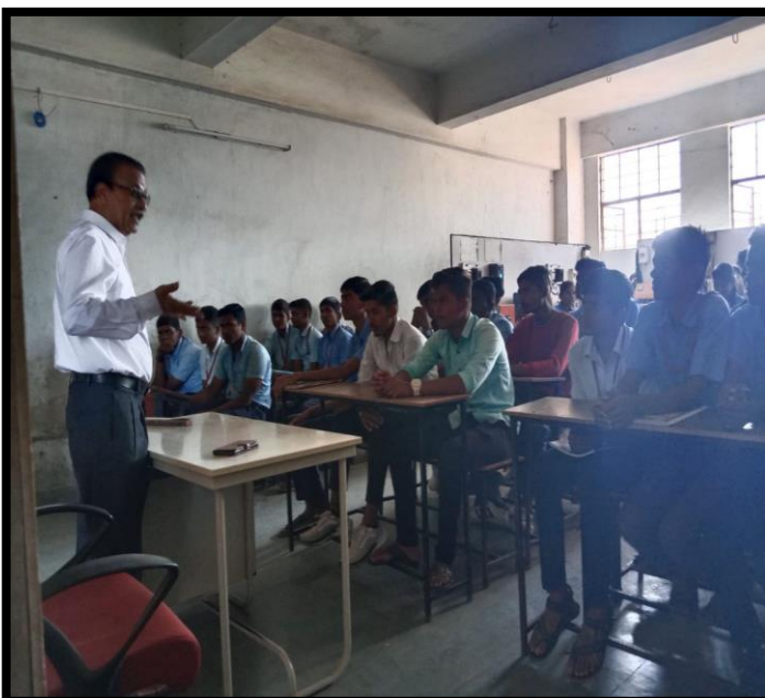
English Speaking Lecture