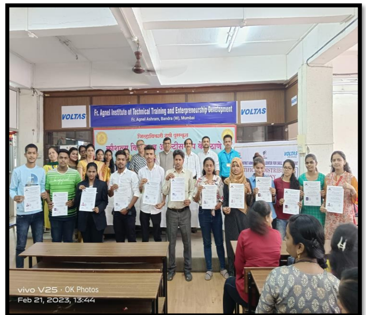
Certificate Distribution Program