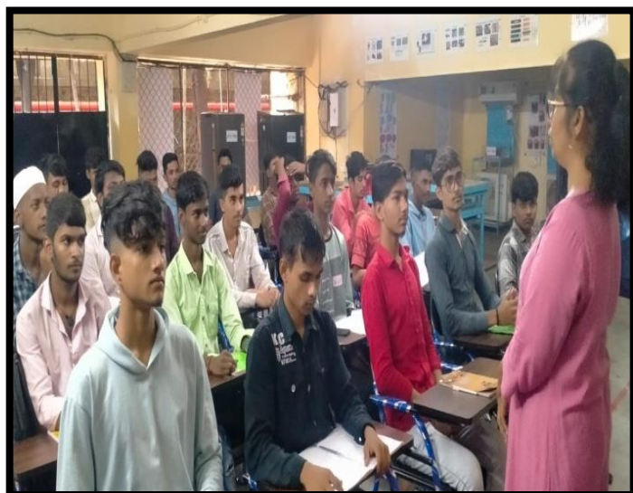
Soft Skill Session