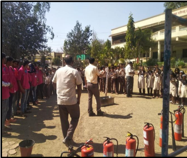
Workshop Fire & Safety