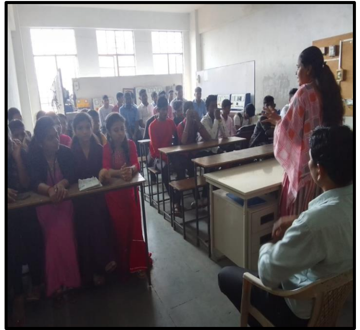
Bank Person Lecture