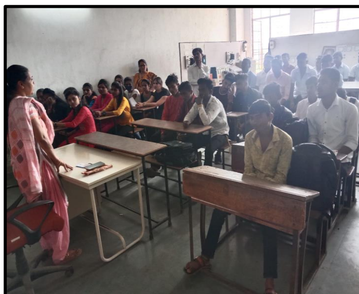
Bank Person Lecture