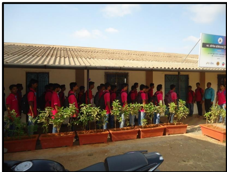
Daily Morning & evening prayer