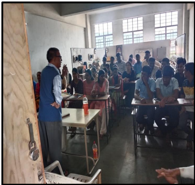
English Speaking Lecture