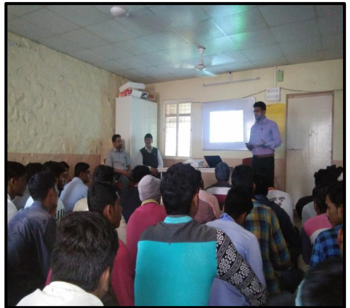
Workshop resume writing