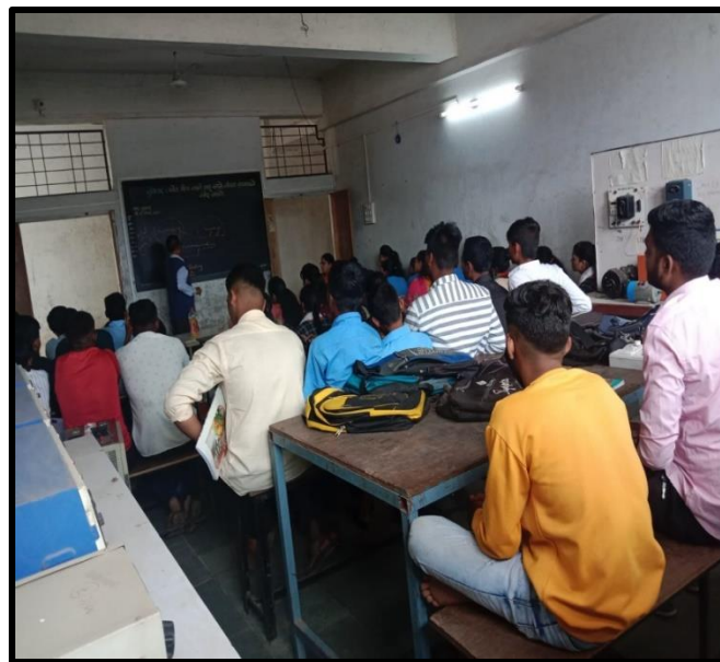
English Speaking Lecture