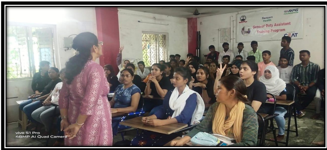
English speaking lecture