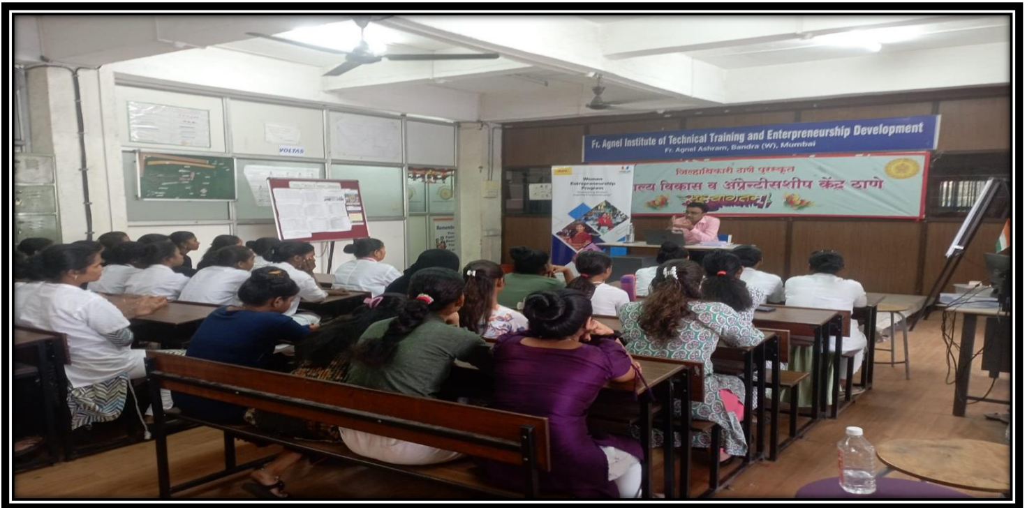
Bank Person lecture