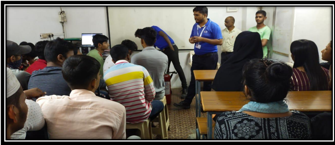
Fire and safety lecture