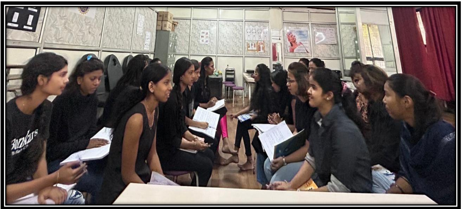
Student Center Activity